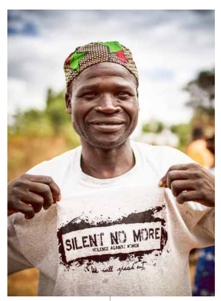
Photo: A man speaking out against sexual violence in Malawi

The extent and severity of sexual and gender based violence around the world is truly shocking. Sexual and gender-based violence it is a global threat to the life and dignity of women and girls, men and boys; it also poses a challenge to social and economic development. However it remains largely hidden as an issue.