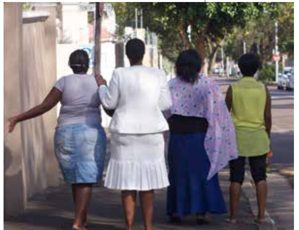
Survivors are forming networks across South Africa to speak out and change policy and practice