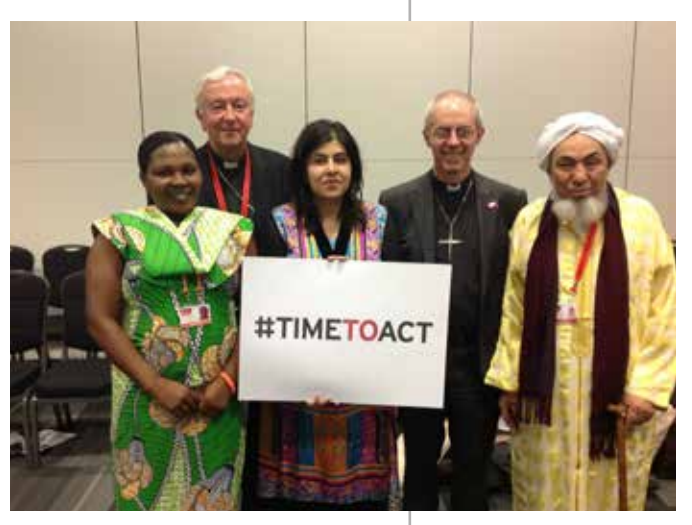
Faith leaders met to discuss the role of faith communities in ending sexual violence at the Global Summit to End Sexual Violence in Conflict in June 2014. They are photographed here with LIK Government Minister Baroness Warsi

There is an overwhelming need for religious leaders to confront the realities of sexual violence and speak out clearly at every opportunity.