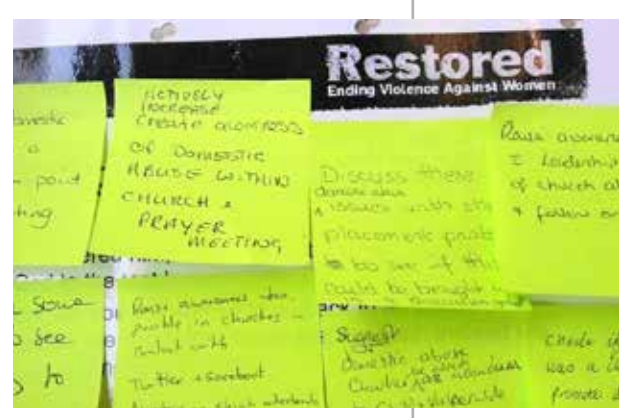
Photo: Examples of actions participants will be taking to end violence against women, after a training day by Restored in Cardiff Baptist College. © Restored

Is your church equipped to support survivors of domestic violence? Will they know how to respond? Restored can provide guidance to ensure the church is a safe haven for victims of domestic abuse and that it is able to support women who seek help.