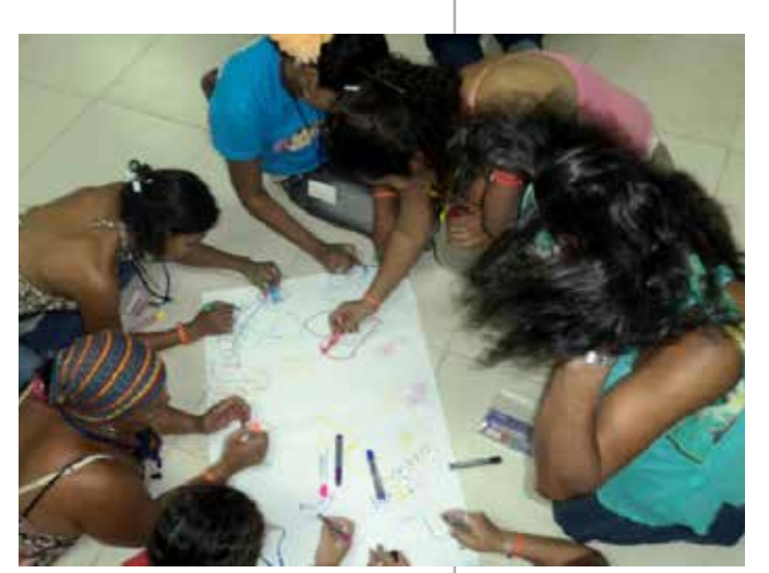
Photo: Adolescent girls at risk from sexual exploitation attend an educational workshop © Association Mary Barreda

León is the second largest city in Nicaragua and has high levels of poverty, unemployment and underemployment. Girls, adolescents and young women from poor families are particularly vulnerable, as many come from broken homes where domestic and sexual violence is common.