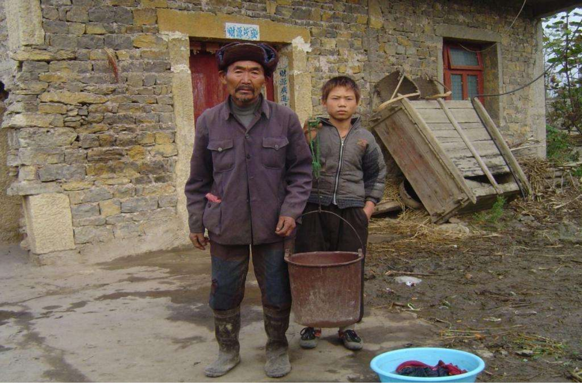
Old and young walk 5 miles for Water