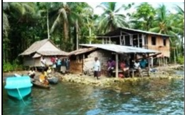
Above: Tagolyn Kabekabe writes about the challenge facing Anglicans in the Pacific on page 5.