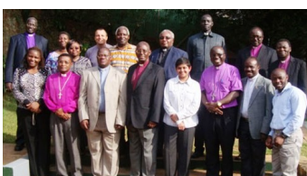
Above: launching the Urban Network at CAPA

and resource, the network looks to serve provinces, dioceses and parishes as they address the changing face of their mission.