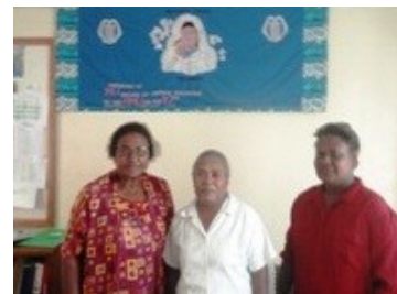
Above: Planning with the ACOM PMU President (centre) and her staff

Women farmers will learn how to ensure sustainable food systems for food security and