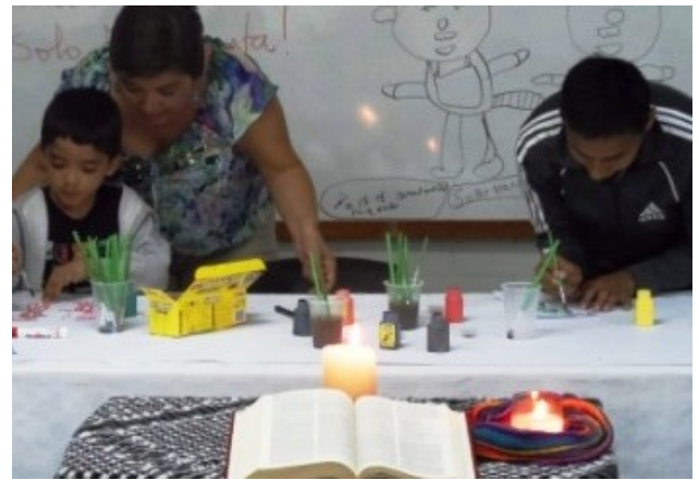
Above: children take part in workshop activities focused on the Bible passage in Luke 24:13-35