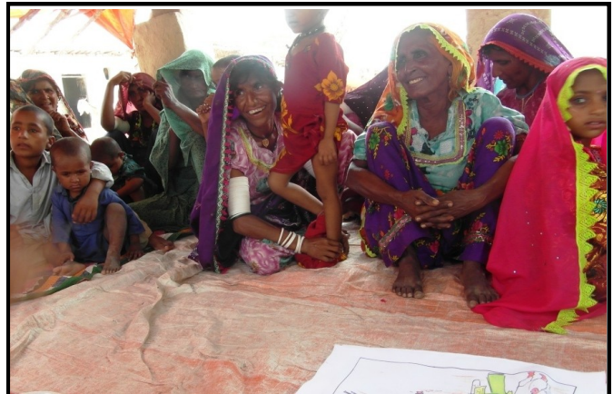
Above: our recent visit to Pakistan prepared communities for the upcoming floods. Read the full story on page three!

We have a global distance learning programme, a presence in advocating at the G20 meetings of the world's richest nations, a response service for Anglican communities hit by disaster, and we are starting to