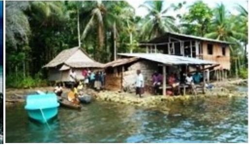
Left: Repi Island is disappearing under rising sea levels. Right: Villagers have resettled near fresh water streams on the island of Kohingo, building homes and schools for future generations.

waves and used rocks and coconut husks to raise their homes.