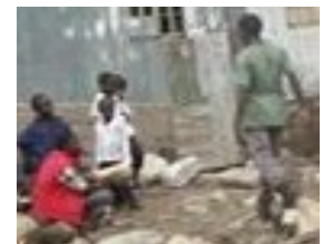
Above: destroyed homes

The Diocese of South Rwenzori in Uganda is calling for support to help flood-displaced communities.