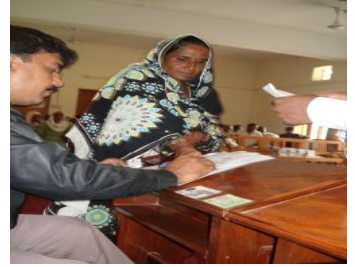
National Identity card Verifying and taking thumb impression