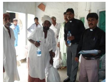
The distribution of relief bags at Mirpurkhas village