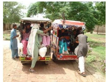
The Christian families are happy and going to their homes with relief bags