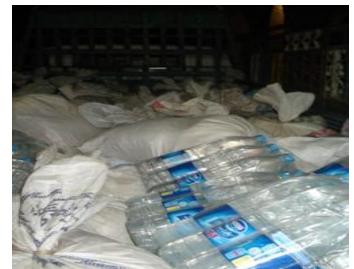
Loading the food stuff bags and mineral water in truck