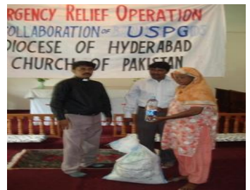
The distribution in Mirpurkhas Church (Rawat Memorial Church)