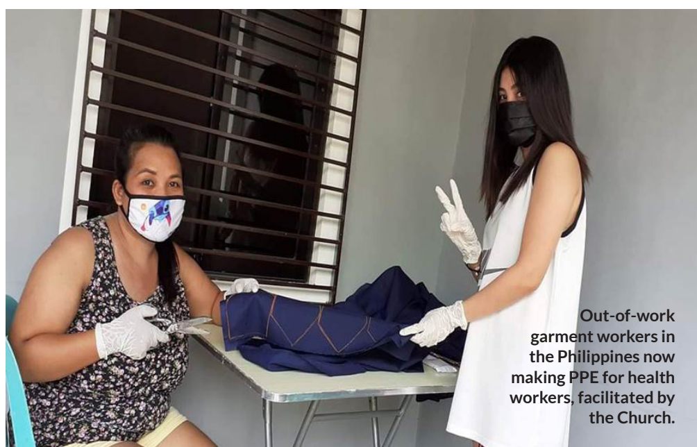
Out-of-work garment workers in the Philippines now making PPE for health workers, facilitated by the Church.

These are just a few examples of the hundreds of creative, positive responses as the churches mobilise to help the most vulnerable around the world.