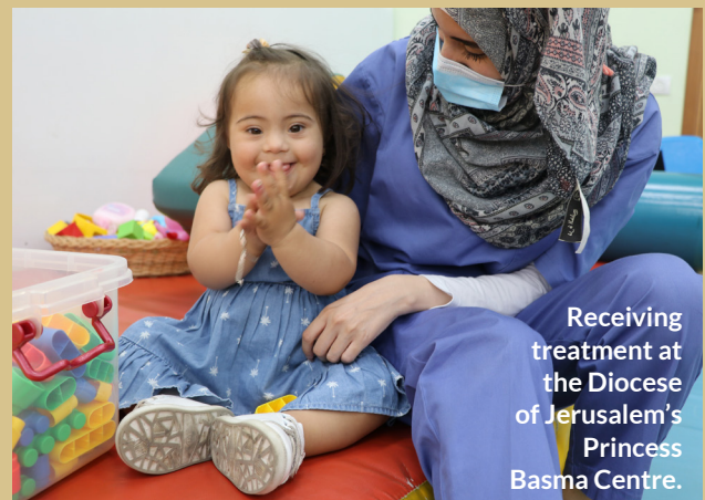
Receiving treatment at the Diocese of Jerusalem’s Princess Basma Centre.

In addition to the process with the group of theologians, the Anglican Alliance is now starting to take this framework of questions to other contexts in the Communion. We are reaching out to the Alliance’s regional fora, the Communion Networks, companion links’ youth-to-youth groups and others, with the invitation to join the conversation of Bible reflection and questions. The Alliance will track these conversations where possible to distil the reflections around the world. We will offer this as a contribution to the Communion’s reflections on what it means to grow fully into God’s Church for God’s World.