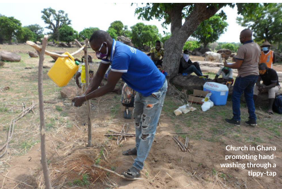
Church in Ghana promoting hand-washing through a tippy-tap