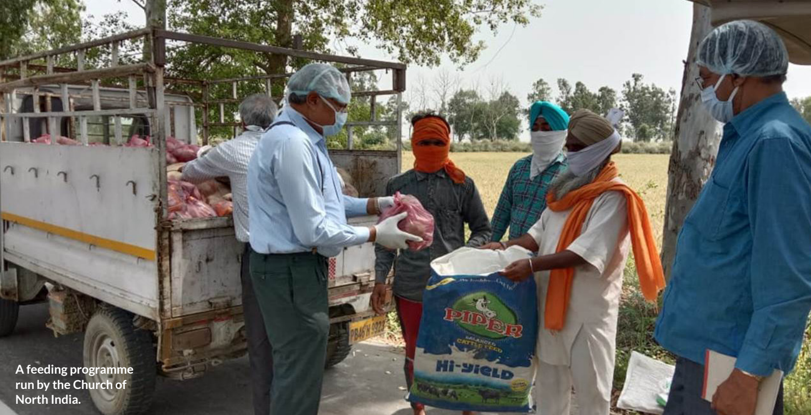
A feeding programme run by the Church of North India.

for migrant workers and promote appreciation of their role. This includes an innovative media project, called 'My Dorm Our Home,' to help build migrant workers' resilience. The entertaining and educational content has been produced in three languages in partnership with the Church of Bangladesh and others.